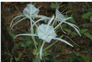
“PLANT OF THE MONTH” – Hymenocallis caroliniana aka Spider Lily

With the assistance of many partners, including the CPC, LNPI has expanded with production facilities now at McNeese State University, Nichol’s State University and the University of Louisiana. A new professorship through McNeese’s agriculture department has initiated some research on establishment and maintenance of native plant production fields. The awarding of a federal appropriation in support of native plant research to McNeese has assisted in keeping this work moving forward.