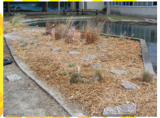
W. W. Lewis School Prairie